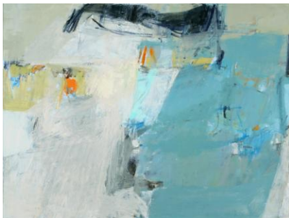
They Talked for Hours, 30 x 36", $4500