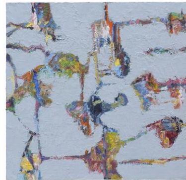
Sunny Disposition, 36 x 36", oil on canvas