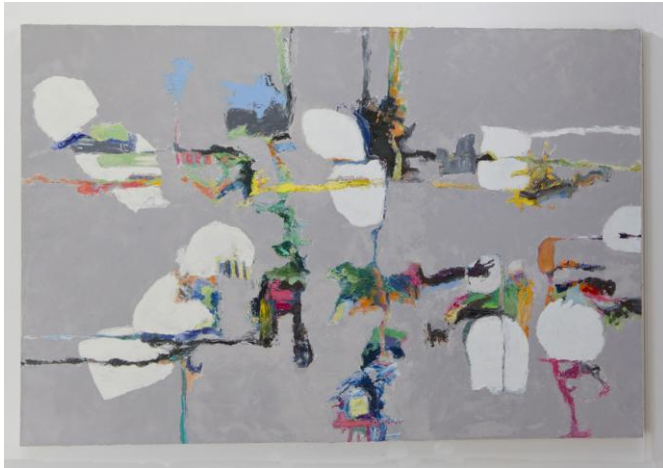
Prairie Schooner, 72 x 48", oil on canvas