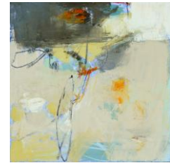
Skyline, 20 x 20", $2500