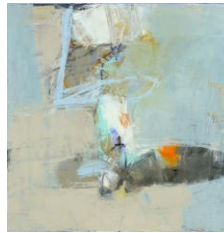
Skyline, 20 x 20", $2500