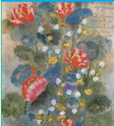
Choegyal DruGu Rinpoche