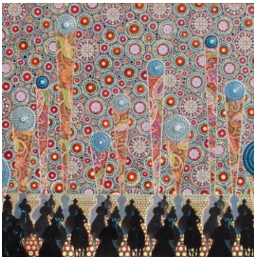
Rodeo Fantasy, 24 x 24”