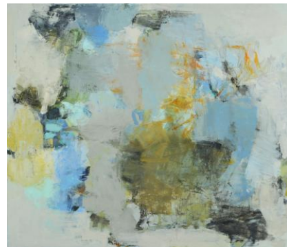
Quicksilver, 36 x 36", $5000