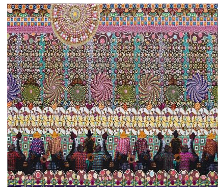
Target Audience, 36 x 24”