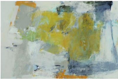
Every Day in June, 24 x 36", $3500