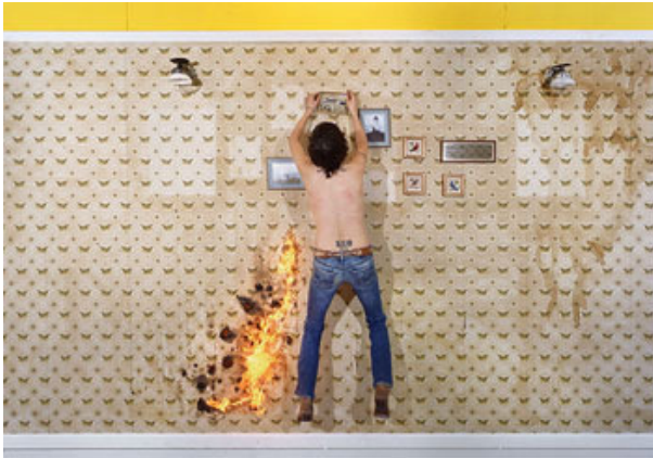
Sandra Burns/ Untitled various sizes, in editions of 5 / chromogenic print / 2009